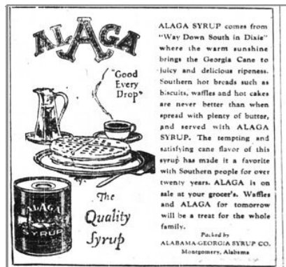
Fig. 5: “Good Every Drop.” The Pittsburgh Courier

Yet another advertisement that appeared in the Courier in 1930 reads “Alaga Syrup comes from ‘Way Down South in Dixie’ where the warm sunshine brings the Georgia Cane to juicy and delicious ripeness...The tempting and satisfying cane flavor has made it a favorite with Southern people for over twenty years” (see Fig. 6).