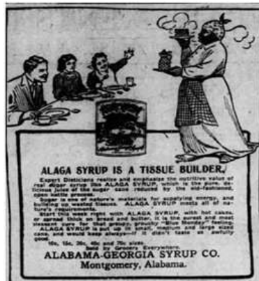
Fig. 1: "Alaga Syrup is a Tissue Builder."

A second ad in the Pensacola Journal on December 19, 1908, features another antebellum mammy tending a kettle of syrup with the copy "The Old Way is the Best Way," claiming all the syrup is manufactured in such a pot and stirred by hand (see Fig. 2).