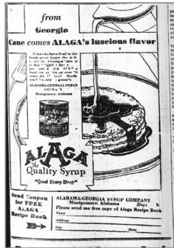
Fig. 7: "from Georgia Cane comes Alaga Syrup." The Pittsburgh Courier .