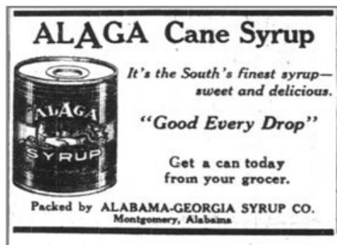
Fig. 4: “It’s the South’s finest syrup – sweet and delicious. The Pittsburgh Courier .”