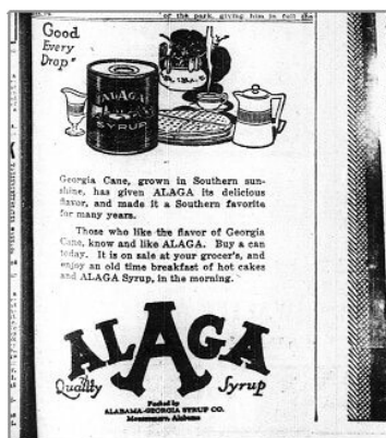
Fig. 6: “Good Every Drop.” The Pittsburgh Courier

Finally, in 1931, the most overt appeal to nostalgia appears: “Folks who have lived in the South never forget the delicious taste of Georgia Cane[,]” which has been “a Southern favorite for over twenty years” (see Fig. 7).