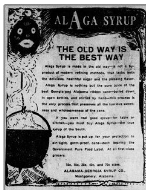
Fig. 2: "The Old Way is the Best Way."

Finally, a third advertisement, also found in the Pensacola Journal from April 3, 1909, eliminates the mammy but asserts that the syrup is "made honestly by the old 'befoh de wah' process" (see Fig. 3).