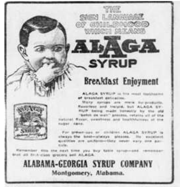
Fig. 3: “The Sign Language of Childhood which Means Alaga Syrup Breakfast Enjoyment.”

Collectively, these advertisements show that, from its inception, the Alabama-Georgia-Syrup Company appealed to its consumers sense of nostalgia, seeking to have its products be associated with its consumers’ memories, however intangible. Of course, such intangibility is irrelevant. The syrup itself provides the memory.